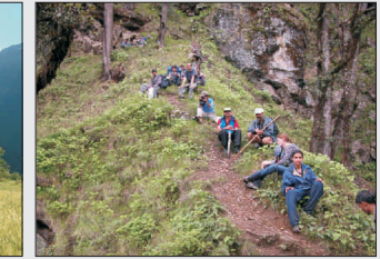
■ Promotes Nature Conservation Education