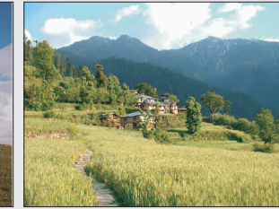
■ Beneficial to the Community