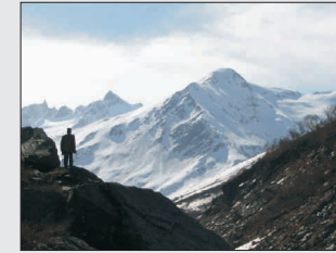
■ Ecologically Sustainable

The Ecozone areas are adjacent to the park and provide a combination of natural and cultural experiences. The trails go through villages and are generally easy to moderate. The best time to visit is during the festival season (October). The treks offer an opportunity to interact with villagers and observe their daily activities, including weaving, basket-making, cooking, and farming. Some popular tour routes are : Neuli-Shangarh Loop, 24 km; Neuli-Manu Temple, 12 km (round trip); Gushaini-Tinder village, 12 km; Siund-Saran-Ghat Seri-Pashi villages, 10 km.