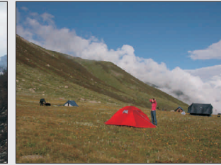
■ Financially Viable